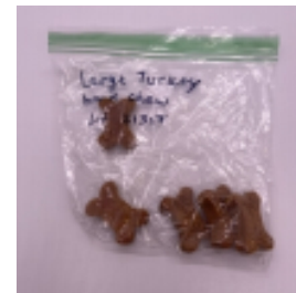
Cannabinoids (% weight)